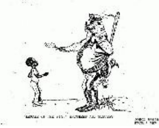
Click for full size picture. (8K)